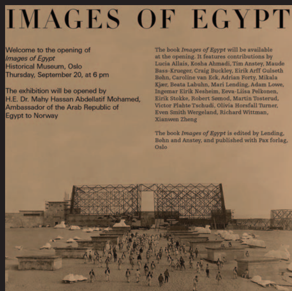
Poster for the exhibition Images of Egypt , Museum of Cultural History, Oslo, autumn 2018. Design: Aslak Gurholt