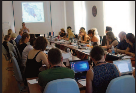
Zadar Summer School (August 2018)