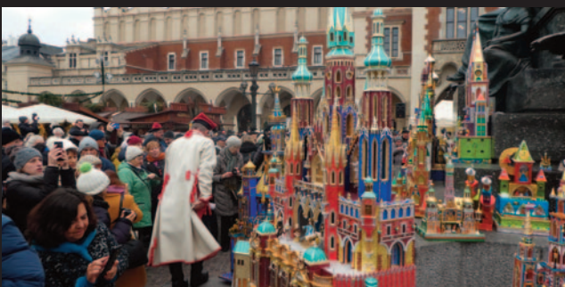
Kraków Nativity Scene Competition 2017 (Poland)