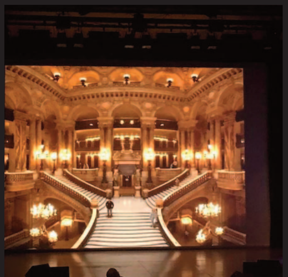
Maude Bass-Krueger lecturing on fashion and architecture at the Musée d'Orsay in Paris, December 2018.