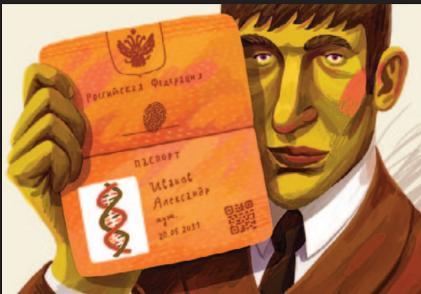
DNA passport Image by Nata Metlukh