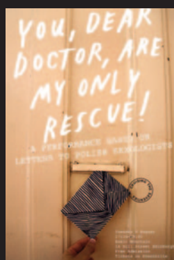
A poster for 'You, Dear Doctor, Are My Only Rescue!', a collaborative performance staged several times across CRUSEV's run, in locations in the UK, Poland, and the Czech Republic.