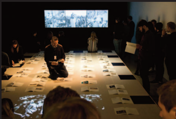
The pilot version of the exhibition Images of Egypt opened at AHO in December 2017.

Style and Cultural Transference encompassed two conferences and a special issue ( Architectural Histories 6(1) 2018, http://doi.org/10.5334/ah.342 , exploring the complex process by which 19th century architecture adopted and adapted architectural motives from the past.