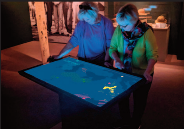
Ancient genome atlas

International PhD summer school: The "DNA and history" summer school ( www.archaeomics.ku.dk ) is an intensive one-week course that was specifically designed for students in archaeology, biology, history and related fields who would like to learn more about the varied uses of ancient DNA and how it can be used to explore human histories. The week-long course is composed of a series of lectures, covering a wide range of topics, and practical hands-on sessions providing students with first-hand experience working with genetic datasets. The course is offered every August at the Globe Institute at the University of Copenhagen.