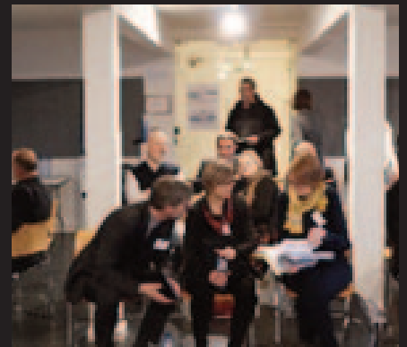
Researchers and local stakeholders engaged in discussion during a break at the 2019 final stakeholders' event in Brussels