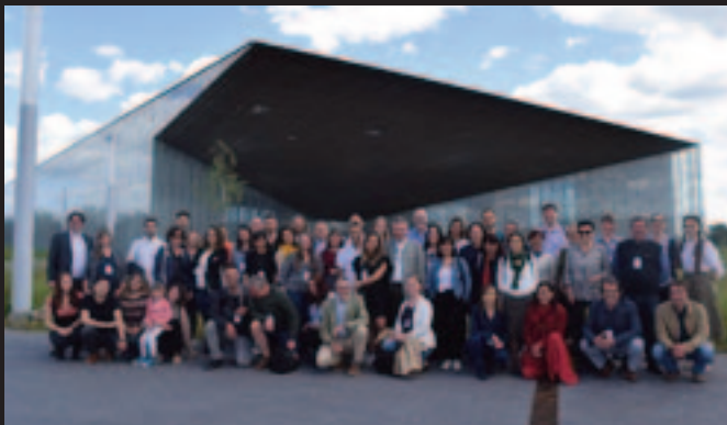
Group photo of the 2018 mid-term conference's participants in front of the venue, the Estonian National Museum in Tartu.

A richly illustrated Open Access monograph, co-authored by MODSCAPES researchers, summarizing the research's main outcomes.