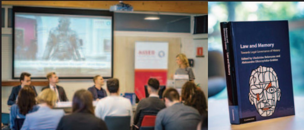
Book launch of Law and Memory: Towards Legal Governance of History (Cambridge University Press, 2017), in the Hague, 19 October 2018.