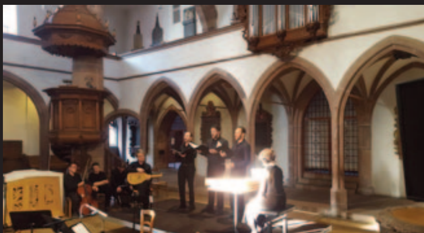
The SoundMe project's concert with Associate Partners La Morra and Bastarda during the 2019 Medieval and Renaissance Music Conference in Basel, Switzerland.