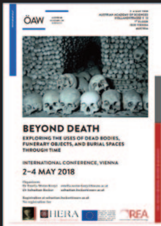
Poster of the project's international conference 'Beyond Death' (Vienna, 2018).