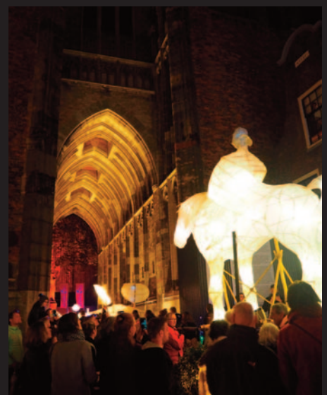
The Utrecht Saint Martin's Celebrations 2018 (Netherlands)