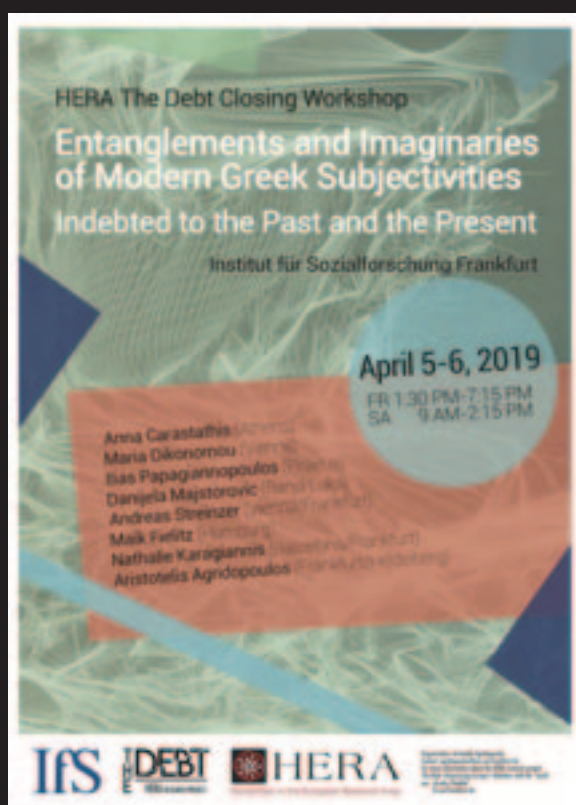
Poster of the project's closing workshop, 5 and 6 April 2019, Frankfurt.