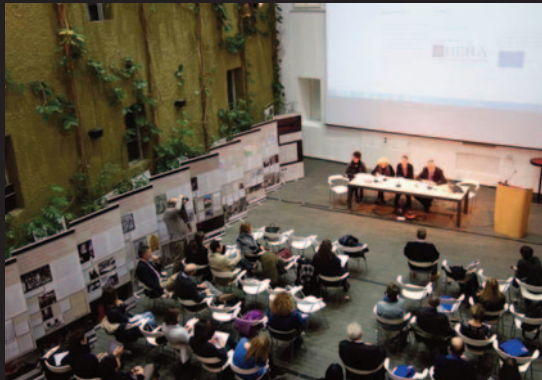
Pls present TranscultAA at the Ljubljana International Conference (March 2018)