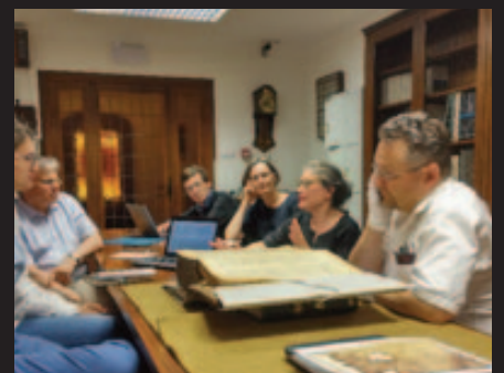
Synergy event, Barcelona, May 24-26 2018