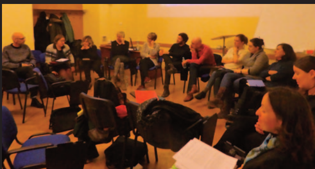
HERILIGION team workshop December 2017 (Kraków, Poland)

Online exhibition and E-book The Heritagization of Religion and Sacralization of Heritage on the project's webpage: www.heriligion.eu