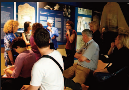
Visit to the Museum of the Jewish Community in Trieste (June 2018)