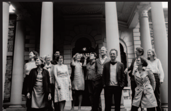
The PriArc team at the seminar "Obsolete Objects", London 2017.