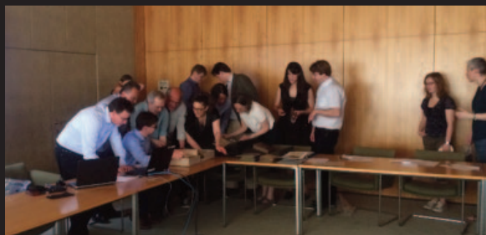
Participants at the After Empire inaugural conference inspecting tenth- and eleventh-century manuscripts from the collection of the Staatsbibliothek Berlin.

A thematic and comparative issue of the online and open access journal "Medieval Worlds" (volume 10, 2019) on Uses of the past in times of transition: Forgetting, using and discrediting the past: https://www.medievalworlds.net/medievalworlds_no10_2019?frames=yes