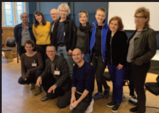
Closing conference and exhibition, Berlin, September 2019