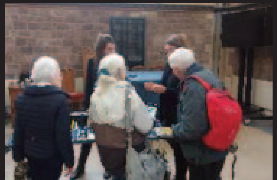
DEEPDEAD displays at the 'Being Human' Public Engagement Festival, 11/2019, Exeter Cathedral.