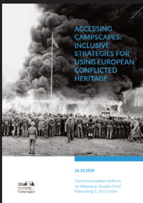
Poster of IC_ACCESS closing workshop at the Vienna Wiesenthal Institute for Holocaust Studies, the 16th-17th October 2019.

the iC-ACCESS E-Journal Accessing Campscapes. This already successful open access journal, distributed via our project website: https://www.campscapes.org/campscapes-e-bulletin/ will be continued from Spring 2020 as the Open Access peer reviewed Heritage, Memory and Conflict Journal to be hosted by Amsterdam University Press: https://www.aup.nl/en/journal/heritage-memory-and-conflict-journal-hmc . The first journal issue will contain the main contributions of the iC-ACCESS project, also to be appear in the AUP Heritage and Memory Studies book series under the title of Accessing Campscapes: Inclusive Approaches to European Contested Pasts : https://www.aup.nl/en/series/heritage-and-memory-studies .