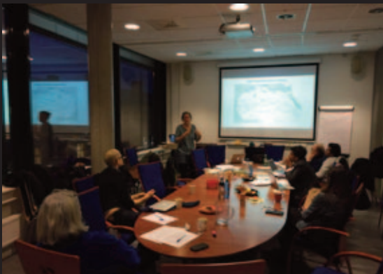
Workshop 'Uses of the Past in Pre-modern Codification and Canonization of Islamic Law', 30th November 2018, University of Bergen, Norway.